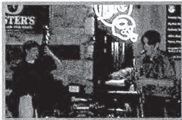
Smooth jazz is the order of the day at 60 West American Grill.