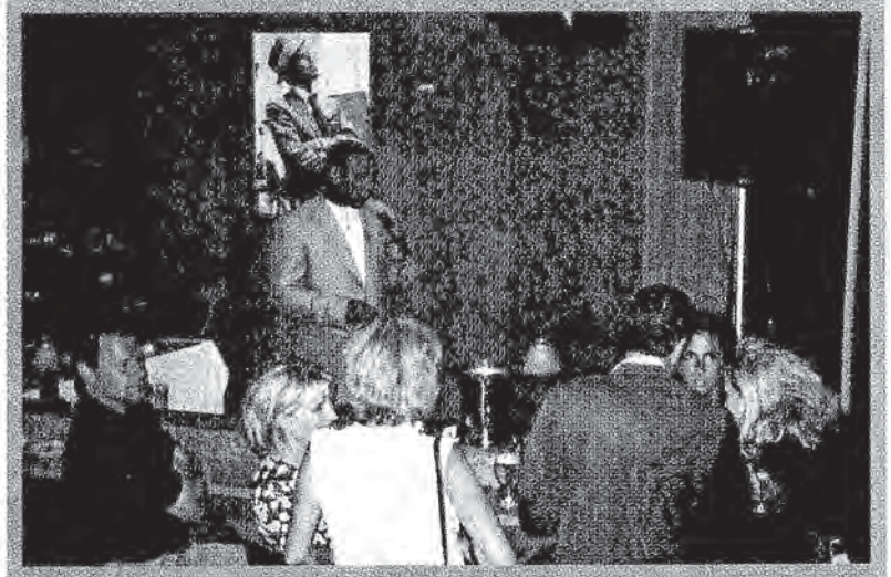
Dishin' out the hits at Porto Bello Steak House