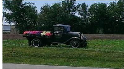
Mini Earth in Grayslake, IL

With our planting done, we took a day trip into the country to watch our very first horse show. Minnesota cousins were in town with three of their horses entered in the 21 st Anniversary Prairie State Classic Horse Show held in Roscoe, IL. Electric fans in the barn kept us, the horses and a surprising menagerie of canines fairly comfortable on a Sunday with temperatures that climbed well into the 80's.